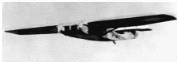
Figure 7. Photograph of the CB-16 lifting-body mono-plane.

name a few. Vincent Burnelli translated these innovations into a number of advanced aircraft concepts; CB-16, GX-3, UB-20, and UB-14, see figures 7, 8, 9, and 10 respectively 119,49 .