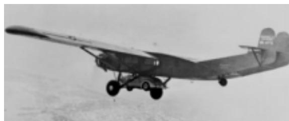
Figure 9. Photograph of the UB-20 lifting-body mono-plane.

body principle, but more noteworthy was that the GX-3 was the first twin-engine aircraft to have a variable area and variable camber wing 71,78 , full-span high-lift flaps 78 , winglets 67 , and pivoting wingtip ailerons 67 , see figure 8. Although the GX-3 arrived late for the competition and did not participate it did demonstrate its outstanding STOL performance capabilities 10,46 . The aircraft demonstrated take-off and landings of less than 300 feet and a landing speed as low as 30 m.p.h..