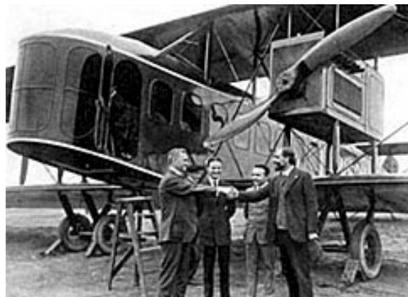
Figure 5. Photograph of the Lawson C-2 Air Line.

Besides being the America's first twin-engine commercial transport aircraft, it was also the first to have an enclosed cockpit for the pilot 1 . The bi-plane was very large, capable of carrying 26 passengers. Burnelli designed the fuselage with load carrying