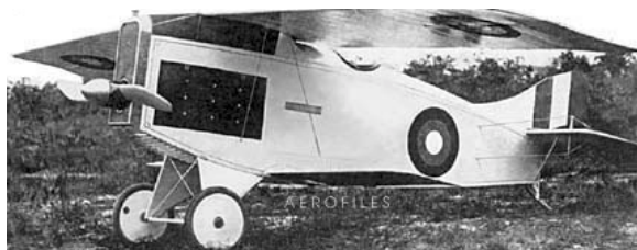
Figure 4. Photograph of the Christmas Bullet.