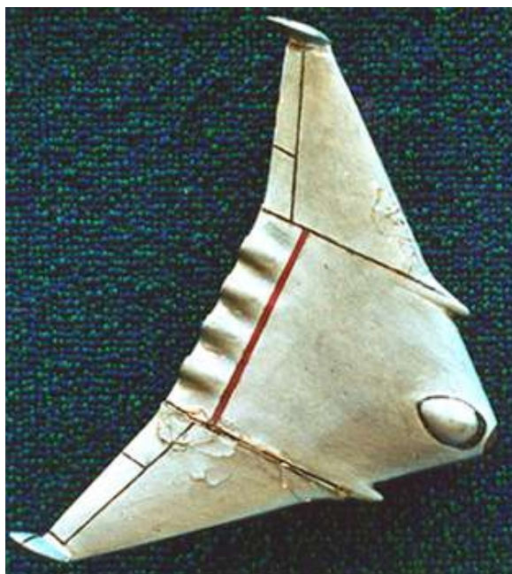
Figure 13. Photograph of a model of Burnelli's advanced transport design from 1951.

In 1944 Burnelli was recognized by the aeronautics community when he received the Fawcett Honor Award for his “Major Contributions to the Scientific Advancement of Aviation”. Over the next two decades he continued to design and innovate addressing such diverse technical issues as boundary layer control, flush inlets, jet propulsion, and all-wing designs for a two-person sport plane and a 1000 passenger transport aircraft 94-102,108-116 . A photograph of a Burnelli transport model is depicted in figure 13.