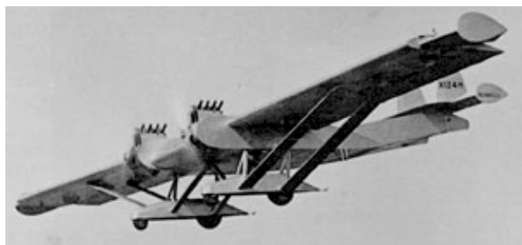
Figure 8. Photograph of the GX-3, the 1929 Guggenheim Safe Aircraft Competition.