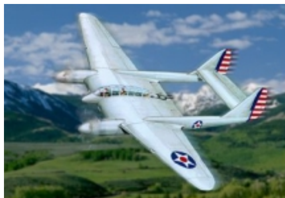
Figure 11. Artist rendering of the XBAB fighter bomber.

OA-1 was a completely new design it did maintain all of the salient features of the Burnelli lifting-body design principle. Unfortunately only one of the aircraft was produced.