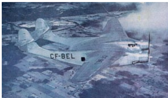
Figure 12. Photograph of the CBY-03 cargo aircraft.

In 1944 Burnelli was recognized by the aeronautics community when he received the Fawcett Honor Award for his “Major Contributions to the Scientific Advancement of Aviation”. Over the next two decades he continued to design and innovate addressing such diverse technical issues as boundary layer control, flush inlets, jet propulsion, and all-wing designs for a two-person sport plane and a 1000 passenger transport aircraft 94-102,108-116 . A photograph of a Burnelli transport model is depicted in figure 13.